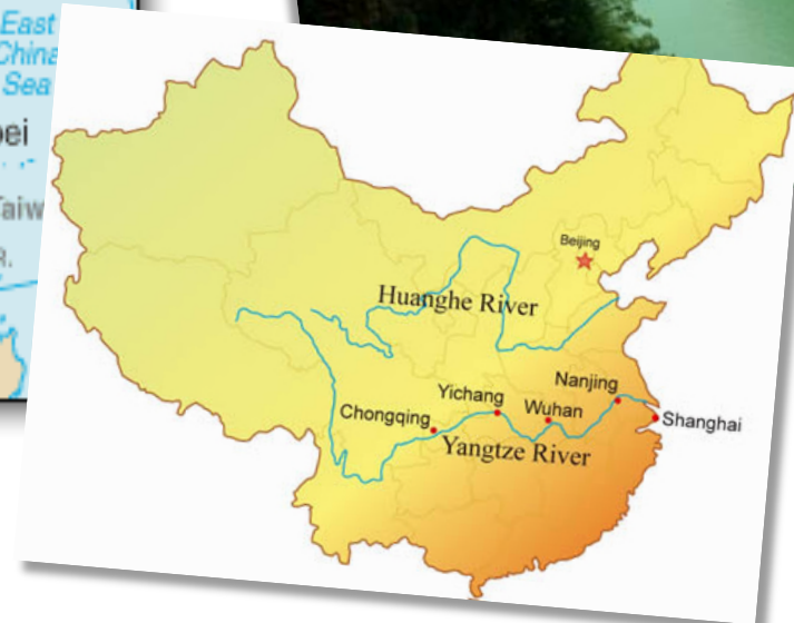
Yellow River (Huang He /黄河) and Yangtze River (Chang Jiang /长江)